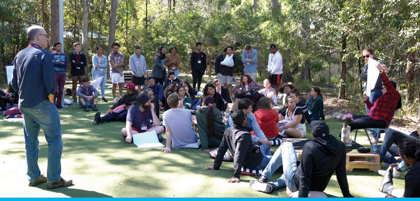
Unite Young Adults Retreat